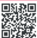
ZWEZ-Lube MP \text{MoS}_2 Lubricant

Impressum: Zwez-Chemie GmbH Schreinerweg 7 51789 Lindlar - Germany