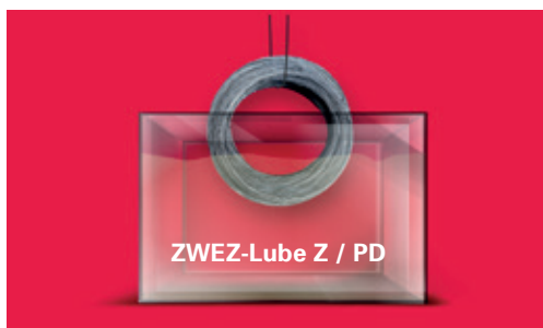
ZWEZ-Lube Z Soap Lubricant

ZWEZ-Lube MP 3 and ZWEZ-Lube PD 395 are suitable for the processing of almost all ferrous and non-ferrous materials, especially high carbon steel, high alloy steel grades and stainless steel. Even in multiple drawing operations they show high performance resulting in a very levelled coating with excellent adhesion.